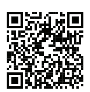
Art for Kids Hub How to Fold a Simple Origami Boat

Then have fun folding a 3D boat together and seeing if it will float in your sink or bathtub. All you will need is one piece of paper per boat. Scan or click on the QR code below to follow a simple folding tutorial. You could also make a small flag for your boat with a toothpick and washi tape or paper. To make your boat more waterproof, rub the bottom of your boat with a candle. The wax will rub off onto the paper and make it waterproof!