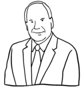
Ronald A. Rasband