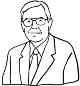
M. Russell Ballard