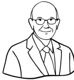
Dallin H. Oaks