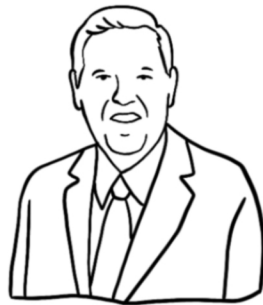
Jeffrey R. Holland