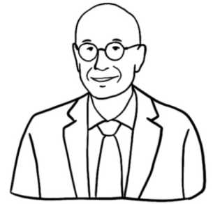
Henry B. Eyring