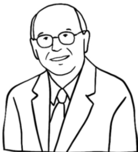
Quentin L. Cook