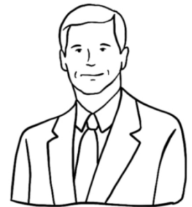
David A. Bednar