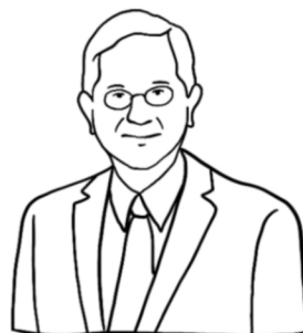
Gerrit W. Gong