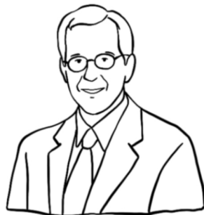
D. Todd Christofferson