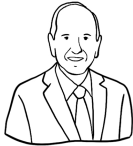
Russell M. Nelson