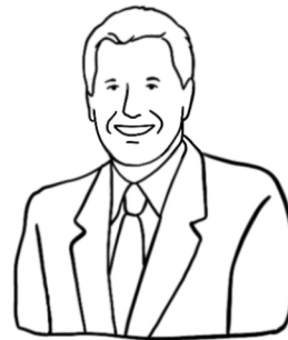
Dieter F. Uchtdorf